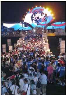
Pictured left, Closing Ceremonies. Below, left to right, sight seeing, the Gold medal from Greece and The Winners!!